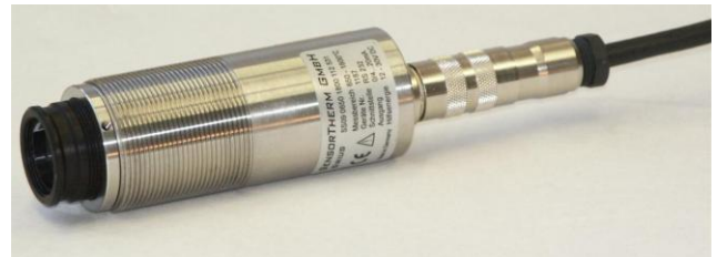
Sirius -Pyrometer in stainless steel housing

Lenses: The infrared energy radiated by the target is centered directly on the detector by factory provided focused lenses. Lenses are made of BK7, an optical glass which is highly transparent in the spectral region of Sirius SS and SI . If additional windows are necessary, they must offer similar optical characteristics. The detector is sensitive to infrared radiation in an area called cone of vision . This area has to be kept free from any intervening objects. For the spot size diameter Ø of it at shortest, medium and widest distances, if focused, pls. see Chart 2 . The cone of vision diameter in front of the lens is about 14 mm. The spot size diameter for distances not given in the chart can be calculated by interpolation.